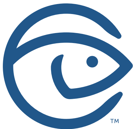
Parent Fish Mark