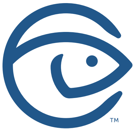
Parent Fish Mark